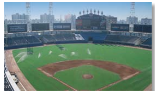
U.S. Cellular Field—Illinois