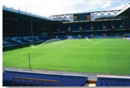
Tottenham Hotspur Football Club—England

Safety is a key consideration in designing any athletic field. As the top choice at sports facilities worldwide, Hunter's rotary sprinklers are designed to be fully integrated into