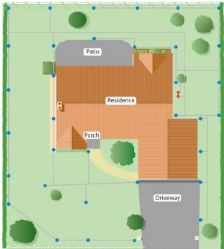
Sample yard with MP Rotators