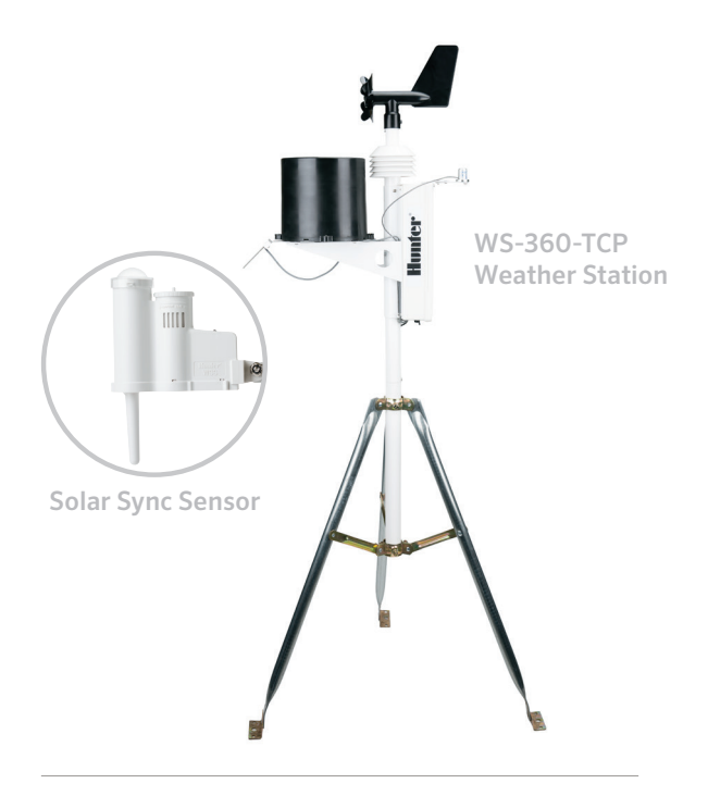
The Hunter Weather Station and Solar Sync Sensor deliver maximum water savings by allowing irrigation only when it's needed.