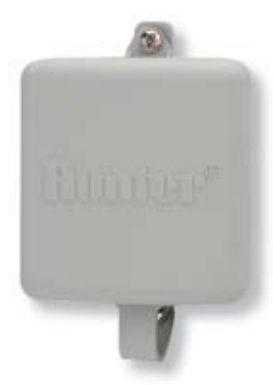
The Wireless Rain-Clik or Wireless Rain/Freeze-Clik can also be installed with an outdoor controller. Just use the included weatherproof rubber cover.