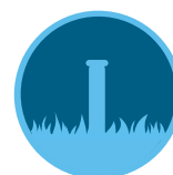
Eco-Indicator Page 173