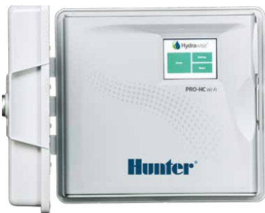
Pro-HC Controller 6-, 12-, and 24-station count