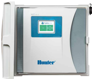
HCC Controller 8- to 54-station count, EZDS two-wire option