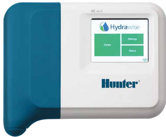
HC Controller 6- and 12-station count

EPA WaterSense Approved Recognized as a responsible water-saving tool by the U.S. Environmental Protection Agency