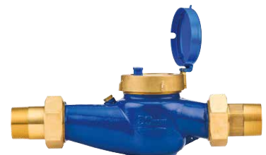
HC Flow Meter Add an optional flow meter to receive flow alerts and monitor water consumption