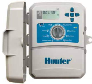
X2 Controller with WAND Module 4-, 6-, 8-, and 14-station count