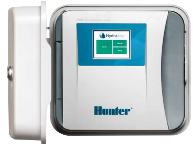
HPC Controller 4- to 16-station count