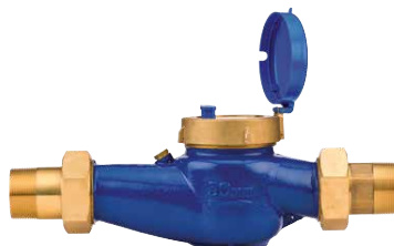
Flow Meter Add optional flow meter for flow alerts and monitoring water consumption