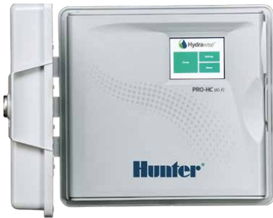
Pro-HC Controller 6, 12, and 24 station controller