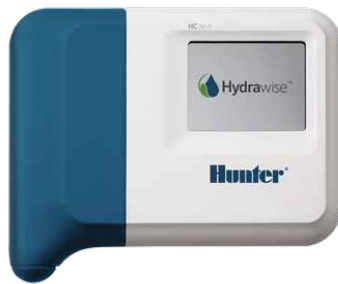
HC Controller 6 and 12 station controller