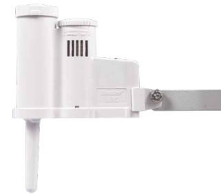
Rain-Clik® Improve water consumption with on-site shutoff