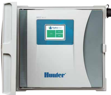
HCC Controller 8-54 station controller