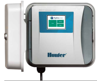
Pro-C Hydrowise Controller 4-16 station controller