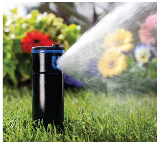
I-20 04 with PRB Body

Continual operating pressure of 3.1 bar; 310 kPa