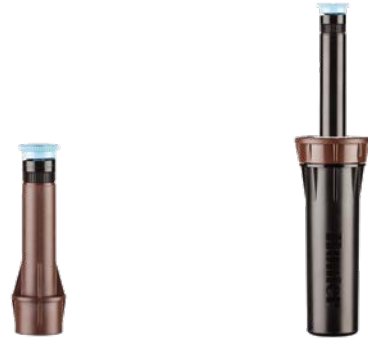
PROS-00-PRS30 Retracted height: 11 cm Inlet size: ½"

▶ = Advanced Feature descriptions on page 64