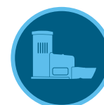
Rain-Clik Sensor Page 144