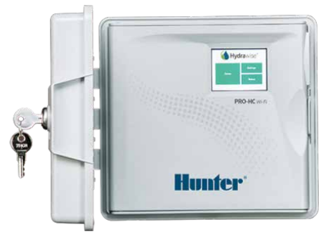
Pro-HC (plastic outdoor) Height: 22.8 cm Width: 25 cm Depth: 10 cm