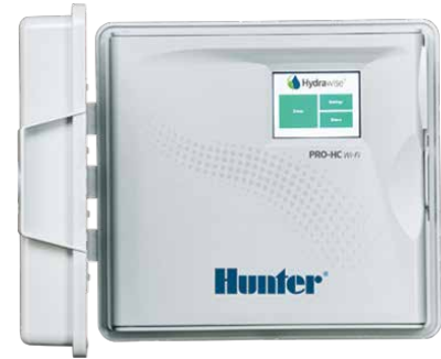
Pro-HC (plastic indoor) Height: 21 cm Width: 24 cm Depth: 8.8 cm