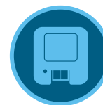
PXS SYNC Accessory Visit fxl.com