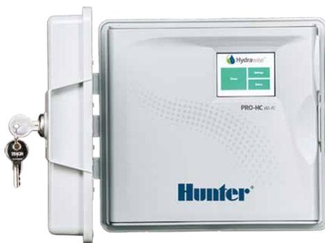
Pro-HC (plastic outdoor) Height: 9" Width: 10" Depth: 4"