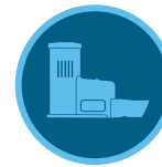
Rain-Clik Sensor Page 134