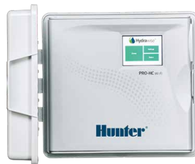
Pro-HC (plastic indoor) Height: 8 \frac{1}{4} " Width: 9 \frac{1}{2} " Depth: 3 \frac{1}{2} "