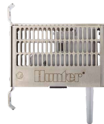
Wireless Sensor Guard (with mounting hardware) Height: 2¾" Length: 3¾" Depth: 1¼"