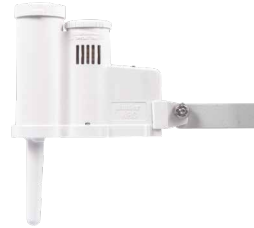
WR-CLIK/WRF-CLIK (with mounting arm) Height: 3" Length: 8"