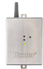
Wireless Receiver Guard (with mounting hardware) Height: 5" Length: 4" Depth: 1¼"