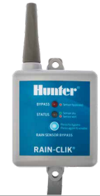
Wireless Receiver (with mounting hardware) Height: 3¼" Length: 4"