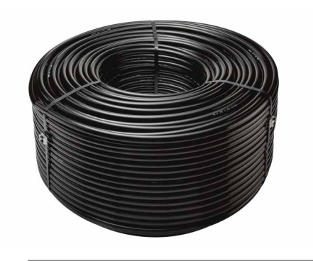
1/2" PE Tubing

TWPE-700-250 = \frac{1}{2} " polyethylene tubing in a 250' roll