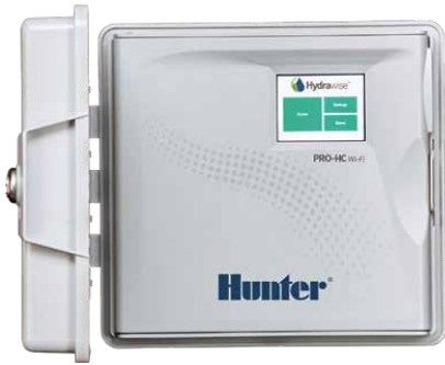
Pro-HC Controller 6, 12, and 24 station controller