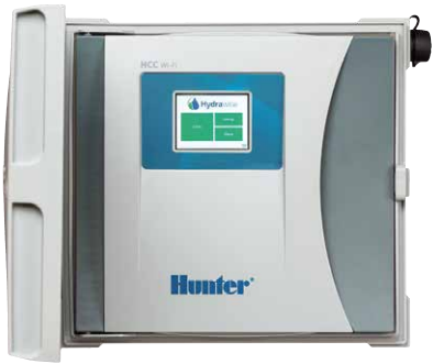
HCC Controller 8-54 station controller