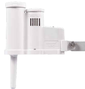
Rain-Clik® Improve water consumption with on-site shutoff