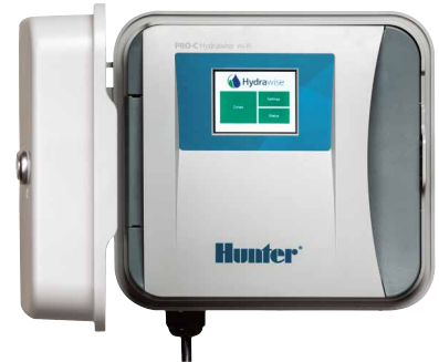
Pro-C Hydrowise Controller 4-16 station controller