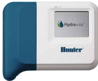
HC Controller 6 and 12 station controller