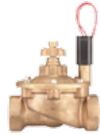
IBV-151G-FS Inlet Diameter: 1½" Height: 6¼" Length: 5¼" Width: 6"