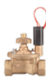
IBV-101G-FS Inlet Diameter: 1" Height: 4½" Length: 3½" Width: 5¼"