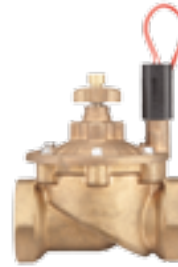
IBV-201G-FS Inlet Diameter: 2" Height: 6" Length: 5¼" Width: 7"