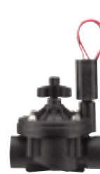
ICV-101G Inlet Diameter: 1" (25 mm) Height: 14 cm Length: 12 cm Width: 10 cm

▶ = Advanced Feature descriptions on page 88