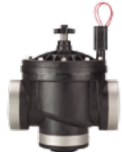
ICV-301 Inlet Diameter: 3" (80 mm) Height: 27 cm Length: 22 cm Width: 19 cm