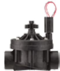
ICV-151G Inlet Diameter: 1½" (40 mm) Height: 18 cm Length: 17 cm Width: 14 cm