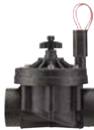
ICV-201G Inlet Diameter: 2" (50 mm) Height: 18 cm Length: 17 cm Width: 14 cm