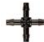
QB-CRS ¼" Barb Cross