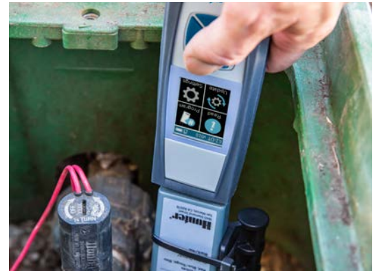
EZ-DT Decoder Diagnostic Tool