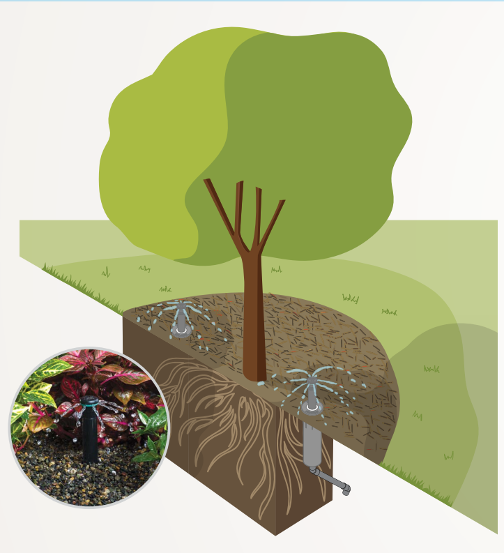
Pro-Spray Sprinkler Bodies are designed for interchangeable nozzles, which allows larger nozzles to be installed as the root zone grows.