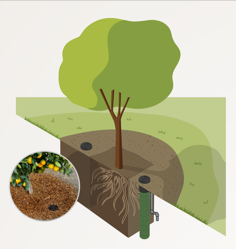
RZWS can be turned off or modified with pop-up spray heads to apply adequate water for maturing trees.