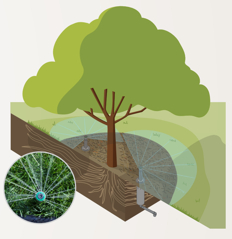
RZWS and Bubbler Nozzles can be modified to MP Rotator Nozzles on pop-up spray bodies to accommodate the water application needs of maturing trees.