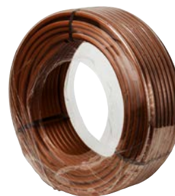
Coil with Stretch Wrap