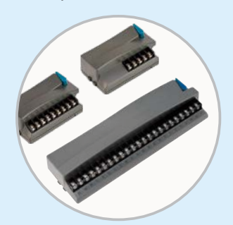
Station Expansion Modules