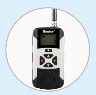
ROAM XL Remote

Hunter Industries is committed to manufacturing top-quality products that use only the water and energy needed to get the job done efficiently. Learn more at hunterindustries.com .