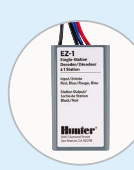
EZ Decoder System