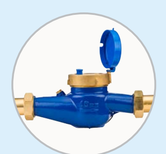
HC Flow Meter